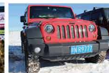
The jeep taking the lead