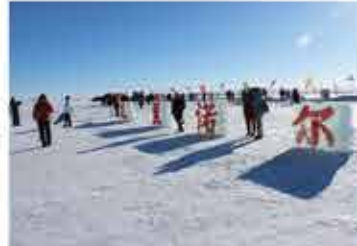
Dalinor Lake, where the temperature there is under 30 degree