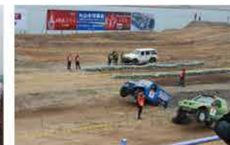
COMFORSER Centrino Motorcade have 6 racing cars running and competing this game