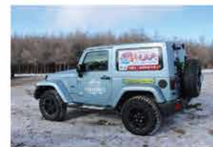
Cross the snow filed