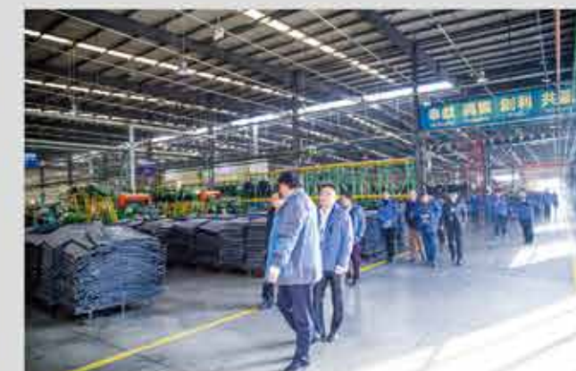
Dengjing lead distributors to our factory