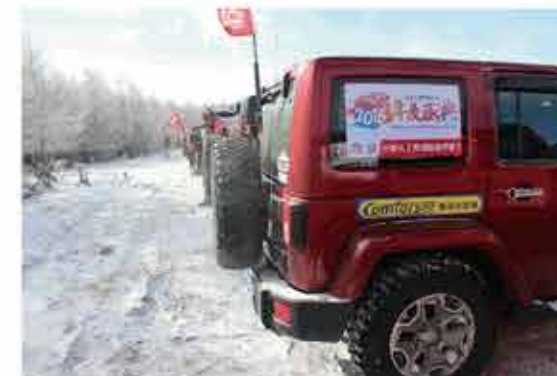
With COMFORSER, the trek story will be richer and fuller

With COMFORSER, the rough road is not hard any more. With COMFORSER, the offroad story will become richer and fuller. With COMFORSER, life experience will be more exquisite. With COMFORSER, the friendship will last forever. The road we choose is rugged, so our life time is bound to be extraordinary, just like COMFORSER.