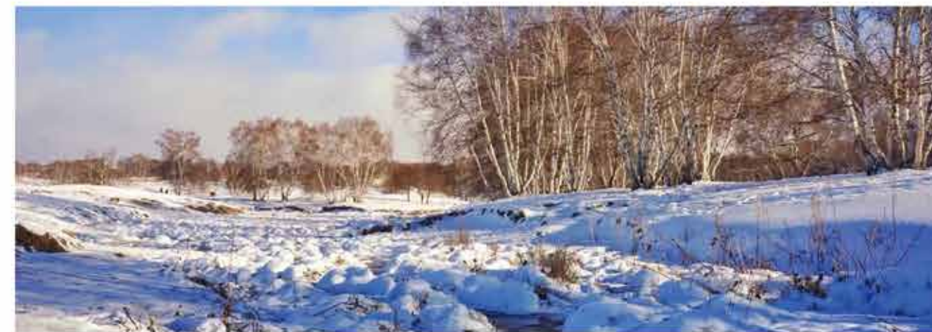
The most beautiful scenery in the most inaccessible area.