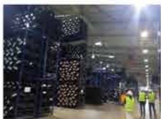
Visiting customers' warehouse

In order to gain more knowledge about the market in east Europe, to provide customers with better services, we paid a in-depth visit to customers in September. Mr. Eugene, the boss of one of the three largest tire companies in Baltic Sea, spoke highly about our star products--the CF3000 tires.