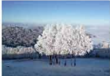
The winter is covered with snow, like a flexible and elegant ink painting.