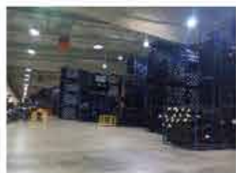
Visiting customers' warehouse