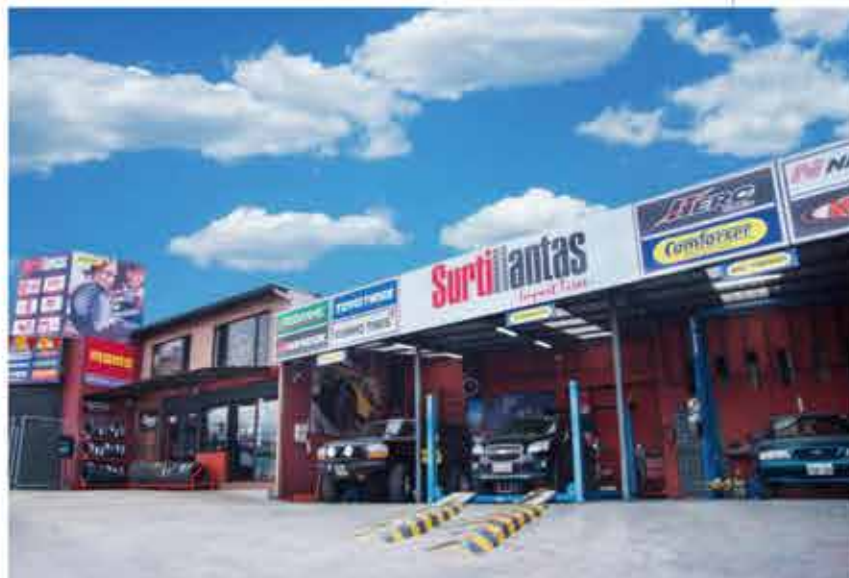
Outdoor Advertising of COMFORSER tire in front of local Auto Supply Stores

Wish 2017 will witness another splendid achievement in Ecu- ador as well as in the whole South America continent.