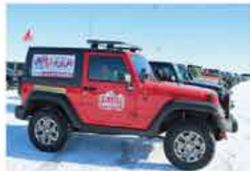
The fearless flag flying in the air The winter is covered with snow, like a flexible and elegant ink painting.