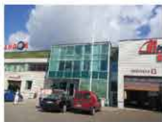
Visiting customers' office and service center