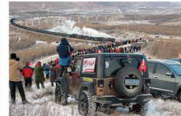
I will never cease traveling ahead, because my name is COMFORSER