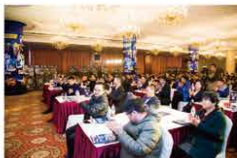
The live scene of COMFORSER & ROADCRUZA PCR Distributors Annual Meeting

Trophies that symbolize great luck at the Year of the Rooster