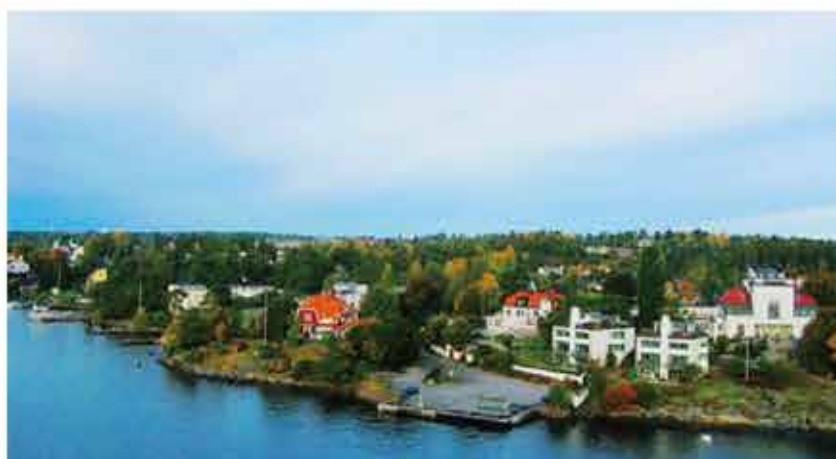
A GLIMPSE OF BALTIC SEA